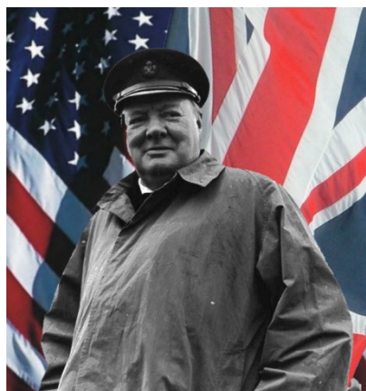
Churchill's Britain Foundation logo

On entering the dog-eat-dog world of British politics Churchill once again faced overwhelming challenges that any normal person would have broken under. Standing up for what he believed in cost Churchill greatly. Throughout much of his political career he was rejected and isolated by many because of his belief in serving the country he loved and the people who elected him to Parliament. "My Great-Grandfather believed in himself, Britain and its people, and so with a self-generated determination he pushed forward and finally, on September 1, 1939, he was proved right as the forces of Nazi Germany invaded Poland."