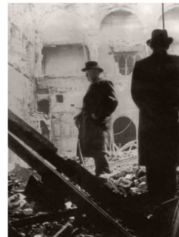
Churchill inspecting the bomb damage to Parliament